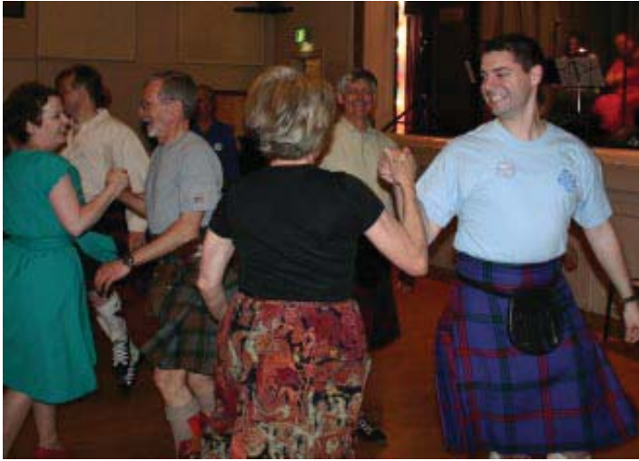
May Monthly Party at San Rafael Masonic hall

Great live music, popular dances, social, and fun