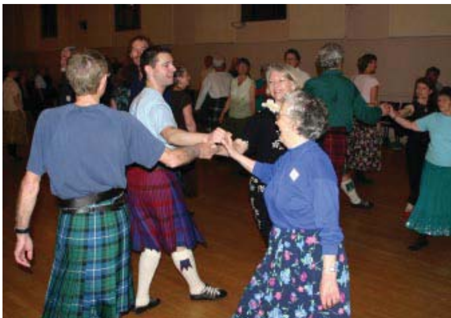
May Monthly Party at San Rafael Masonic Hall

$8 RSCDS members $10 non-members $2 new dancers (with coupon) Free for spectators